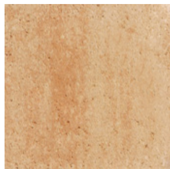
Golden Sand Smooth Finish