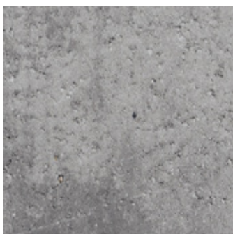
Steel Grey Smooth Finish