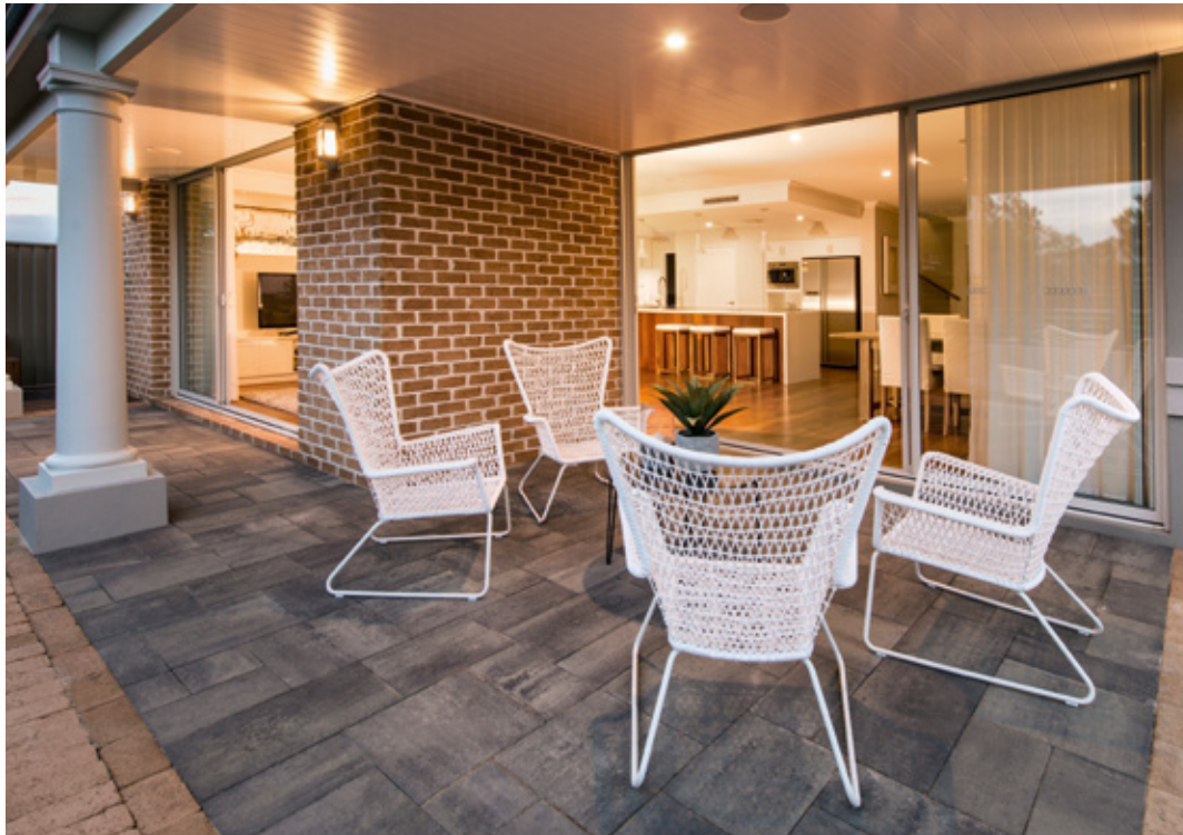
Ashlar Steel Grey used throughout The 2013 Telethon Home including the driveway.

Change the way you think about paving with Midland Brick's latest Ashlar Range. This customised pattern, exclusive to Midland Brick, is formed by using a variety of paver shapes and sizes to create a truly individual look whilst enjoying all the benefits and flexibility of paving.