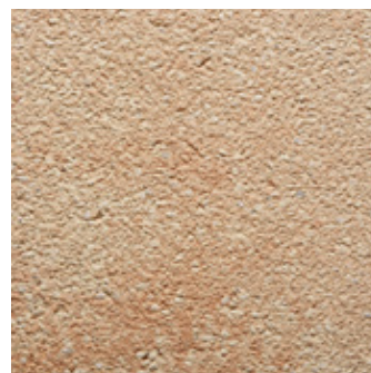
Amber Granite Finish