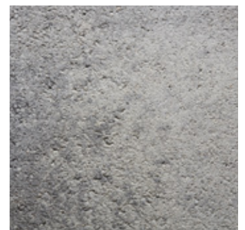
Titanium Granite Finish